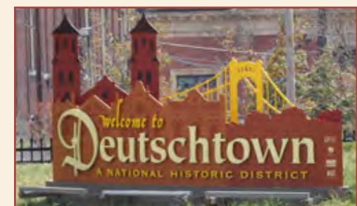
Welcome sign for Deutschtown in Pittsburgh's North Side